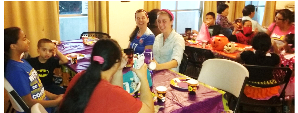
Each year Project Darreis creates a safe space for kids to have fun at Halloween while they also learn that violence is never the solution. Project Darreis feeds and clothes hundreds in need throughout the year. They are one of the OPC's very first partners in ending violence in Oakland.