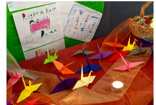
OPC partner St. Mary's Center celebrates International Day of Peace by organizing for homeless people's "Right to Rest." Homeless seniors are creating solutions to the challenges of homelessness throughout the Bay Area as well as mistreatment of homeless people.